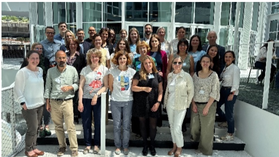
Kick-off meeting in Paris, June 2025